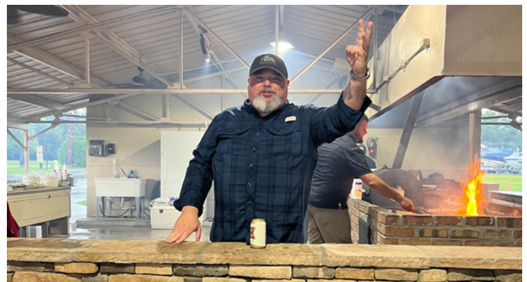
OUR ANNUAL STEAK ON THE LAKE EVENT HAD A GREAT TURNOUT DESPITE THE RAIN

For this reason, he said construction firms should “find those spaces where you can ride out the storm.”